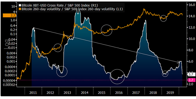
Rising Bitcoin Vs. S&P 500 and Falling Volatility

The trends are gaining technical and fundamental momentum. Bitcoin volatility is diminishing with natural maturity and increasing adoption and vehicles for participation. The 100-week average of S&P 500 Volatility Index (VIX) appears to have begun recovering from record lows reached in 2018 as global recession risks rise. (03/16/20)